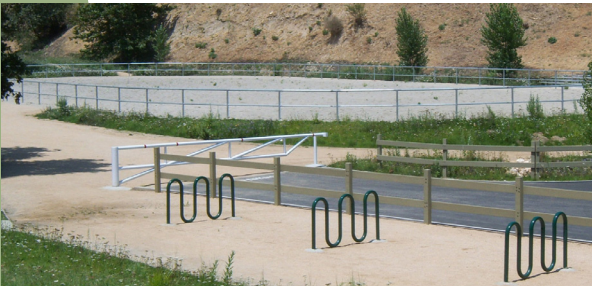
Equestrian riding ring and bicycle parking at Aliso Canyon.

Now it is a reality and an amazing opportunity for those who enjoy nature. There is a great staging area for equestrians, a riding ring (one of the first in the Northwest San Fernando Valley), bleachers to watch riders, and bathroom facilities too. From Aliso Canyon, equestrians and hikers can access the Backbone Trail system and reach O'Melveny Park and points north like Oat Mountain and East Canyon. We wish to remind cyclist and others that no wheeled vehicles of any kind are permitted on any horse trails within the city of Los Angeles.