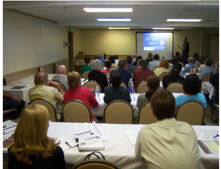
Our 2012 CERT class at Knollwood Country Club.

You will receive 17 ½ hours of training by LAFD personnel, provided free of charge within the city of Los Angeles to anyone 18 or over. TEEN CERT classes are available for those under 18. If you miss a session, you can make it up at another CERT class.