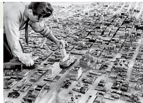
A planner joins with a team to create a detailed model of Downtown. Completed between 1938 and 1940 under the Works Project Administration, this model may still be viewed at the Los Angeles County Museum of Natural History.