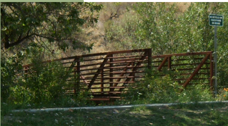
Walking bridge over the creek at Aliso Canyon.

Improvements include: Meadow areas, walking paths, bio-swale, picnic areas with shaded and non-shaded tables, a large picnic area for group use, solar-powered LED minimal lighting, bike racks, horse waterers, hitching posts, separate equestrian vehicle and automobile (including handicapped) parking areas, walking bridge over the creek, California native landscaping, re-graded and paved entrance road, left turn bay on eastbound Rinaldi St., and more. Open sunrise to sunset.