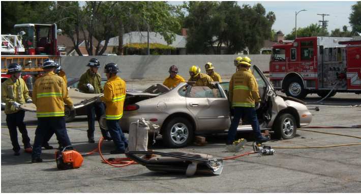
Firefighters and cadets tear apart a car using the jaws-of-life at last year's Disaster Preparedness Fair.

Fire Station 87—10124 Balboa Bl. (between Devonshire St. & Lassen St.)