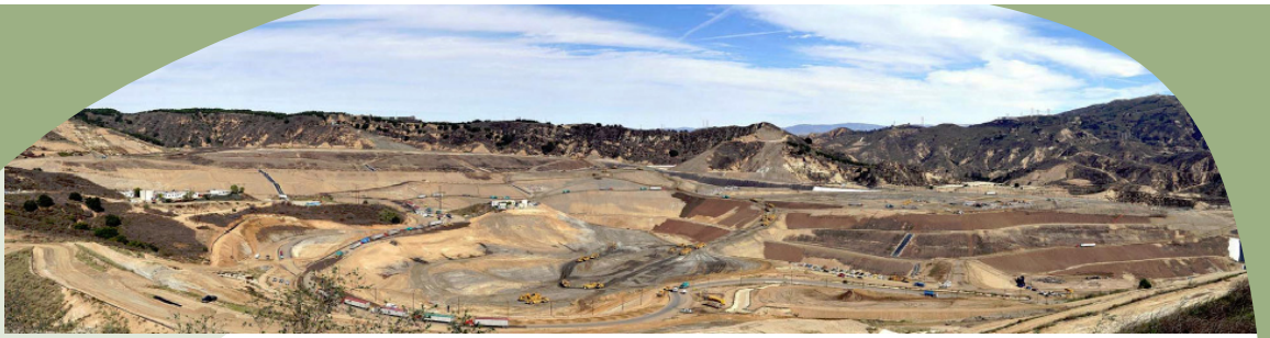
Sunshine Canyon Landfill, operated by Republic Services, Inc., north of Granada Hills by the 5 and 14 freeways.