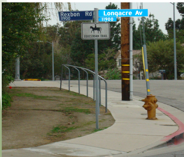
Intersection of Rexbon Rd., Longacre Ave., and Zelzah Ave. Top of school bus is barely visible to cross traffic.

The blind intersection at Zelzah Ave. and Rexbon Rd. has now been upgraded from two stop signs to a four-way stop, with the goal of eliminating downhill speeding and easing the blind uphill approach of Zelzah traffic. Many people that live in this neighborhood have for years been trying to get the four-way stop, more than one of them giving up years ago, even after making trips to City Hall trying in vain to improve this intersection's safety. With help from our GHNNC Public Safety Committee, we got the job done, and the residents are ecstatic.